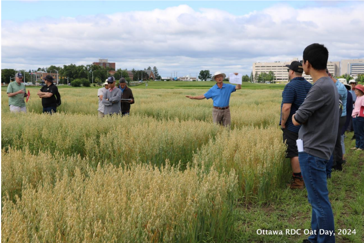
Ottawa RDC Oat Day, 2024