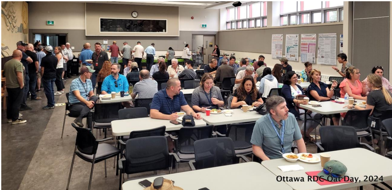
Ottawa RDC Oat Day, 2024

This year for lunch, we had Easy Vegetarian Oat Chili (made with rolled oats), Oat Groats Salad with Carrots, Scallions and Raisins , Potato Salad with Oats , Oat & Mill oat “ice cream”, and various types of oat “milk”, amongst other things.