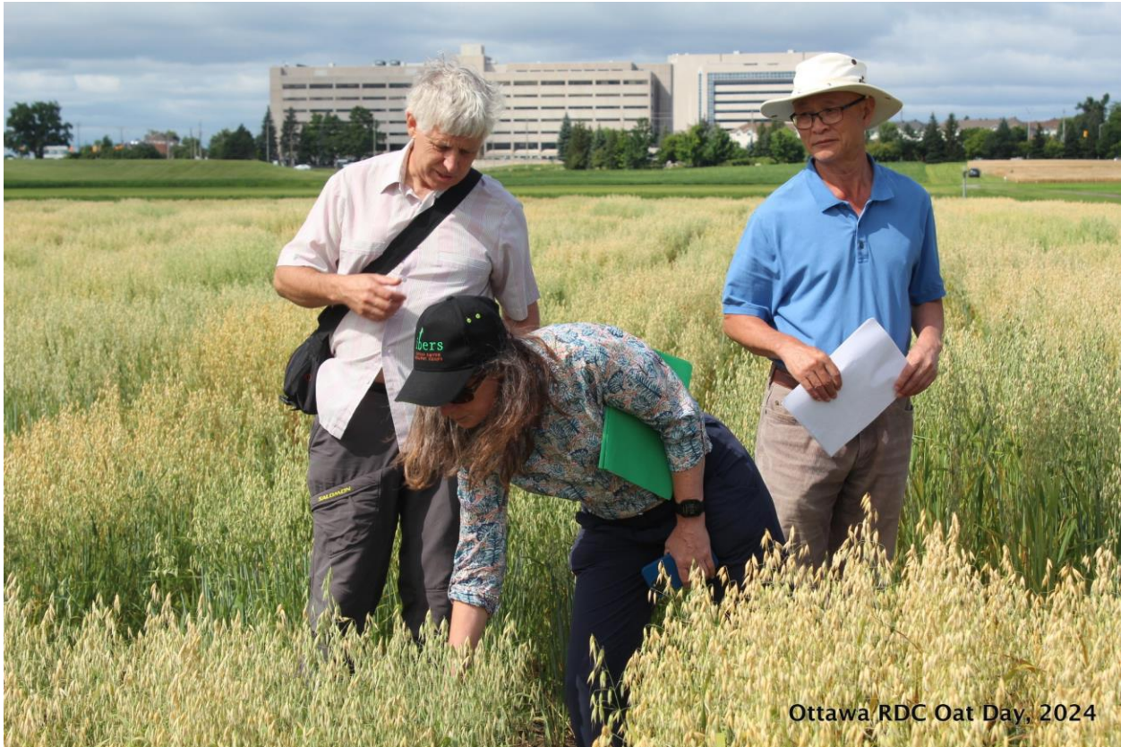
Ottawa RDC Oat Day, 2024

This year for lunch, we had Easy Vegetarian Oat Chili (made with rolled oats), Oat Groats Salad with Carrots, Scallions and Raisins , Potato Salad with Oats , Oat & Mill oat “ice cream”, and various types of oat “milk”, amongst other things.