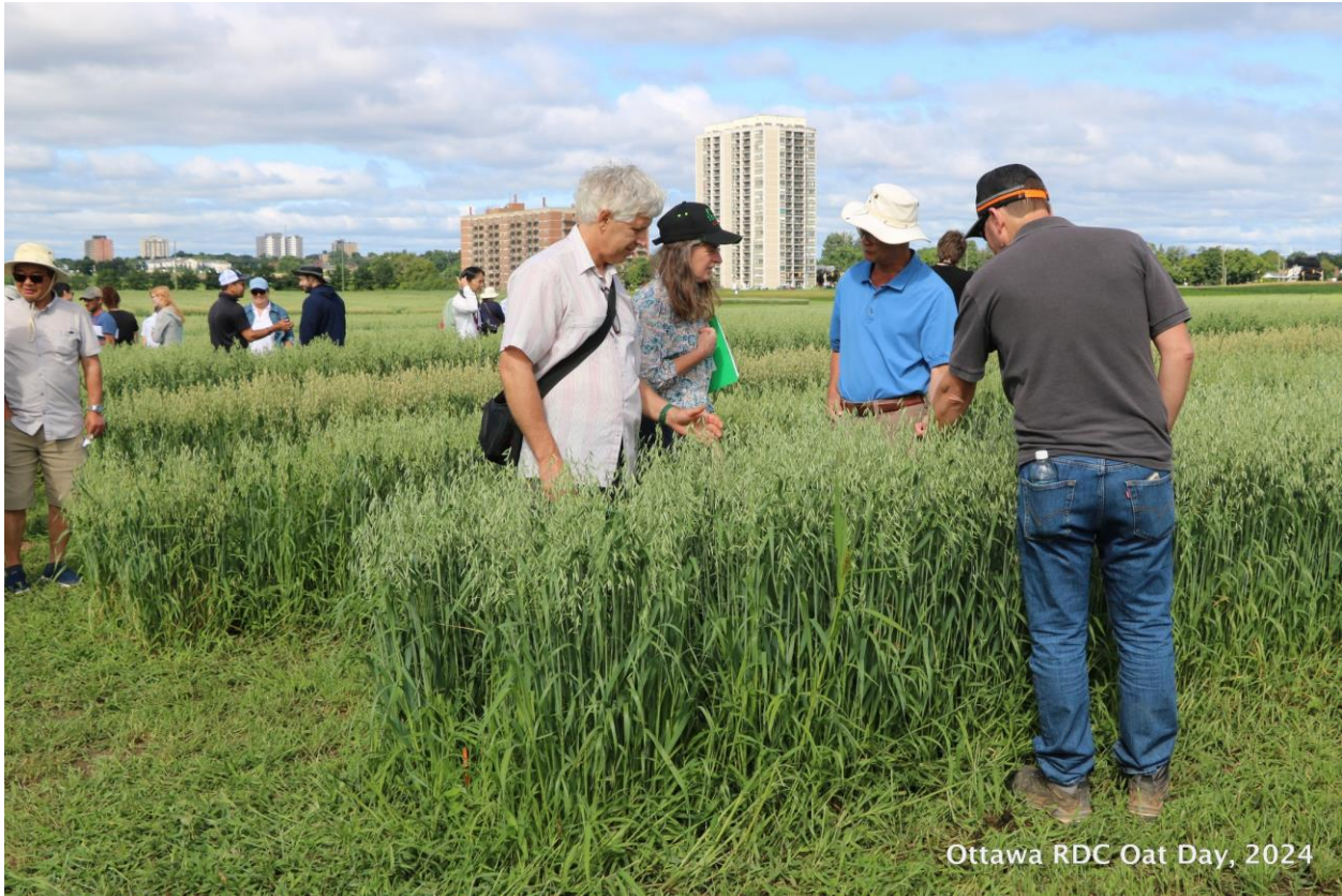
Ottawa RDC Oat Day, 2024