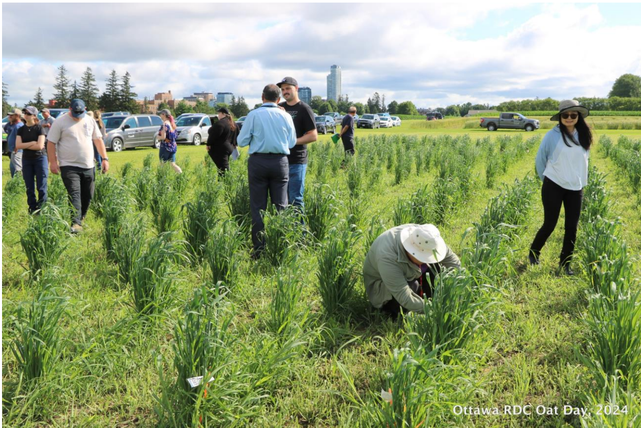
Ottawa RDC Oat Day, 2024