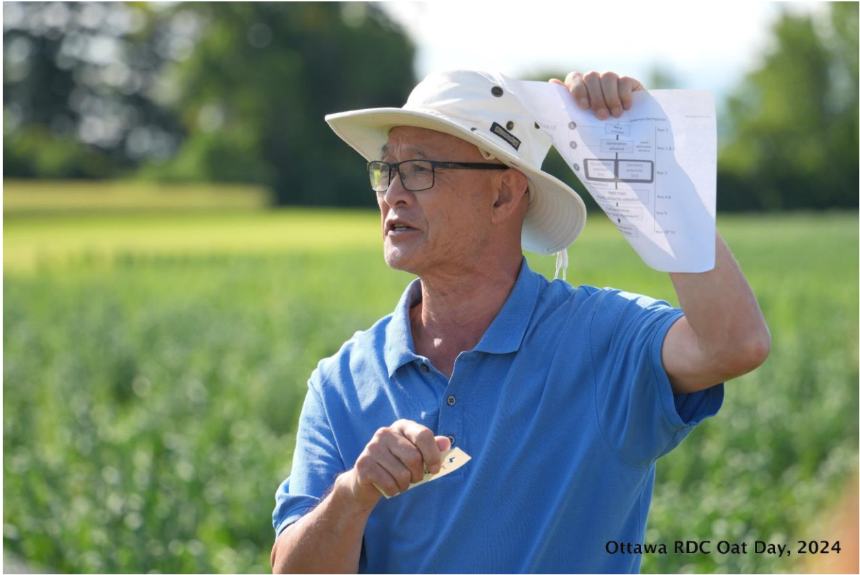
Ottawa RDC Oat Day, 2024