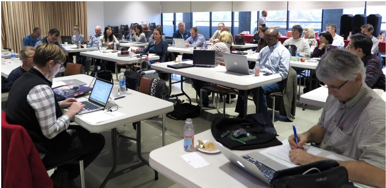
Everyone hard at work....

The banquet for the Oat Rust Forum was held at Moosewood , a world-famous vegetarian restaurant known for its cookbooks!